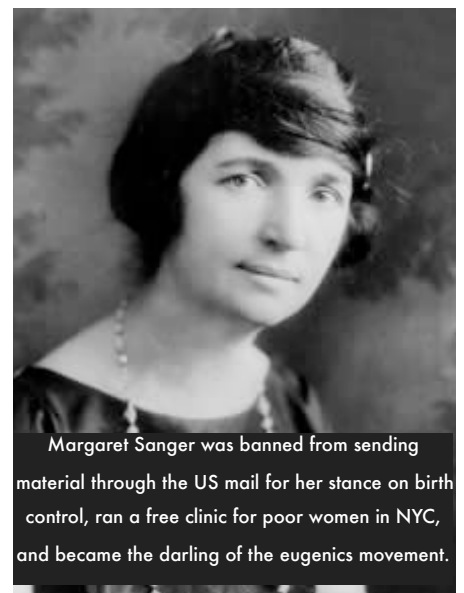
Margaret Sanger was banned from sending material through the US mail for her stance on birth control, ran a free clinic for poor women in NYC, and became the darling of the eugenics movement.

Your written projects grade also includes two projects of your own original work. Both involve planning ahead, research, and well-crafted, evidence-based historical writing. For the first project you will write a paper that uses old documents as evidence for a historical argument. For the second project you'll use and then improve a student-made packet of sources for studying a recent event in American history. See the course website for detailed information and project guidelines for each of these assignments.